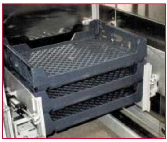
Basket Lifting Detail